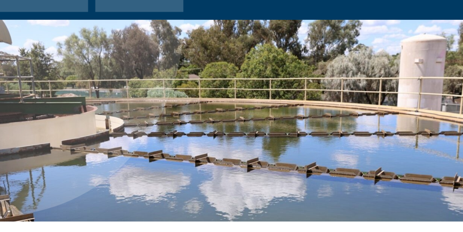
Report 1/58 - March 2024